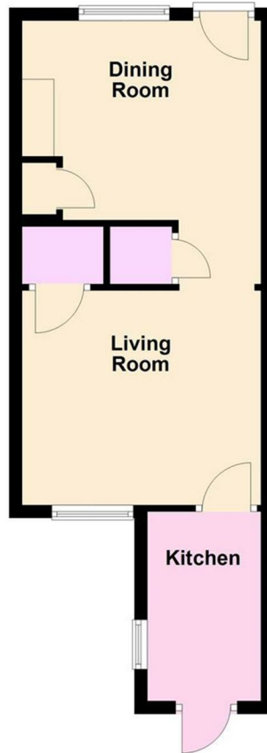
Ground Floor Approx. 33.7 sq. metres (363.1 sq. feet)